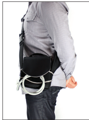
Downsized driver is easier for patients to manage and is more comfortable.

Early last year we shared that we were targeting the end of the second quarter 2012 to demonstrate feasibility of our completely implantable system. We are very pleased that we expect to accomplish this goal by the end of the second quarter 2011. We have two physicians from our current sites that are confirmed to participate in the feasibility testing of this system. To see a future with a "Sync-Pulse" system that can connect to a pacemaker and be able to transmit the power through the skin with no cables or drive lines is truly exciting. Look for more news on this late second quarter.