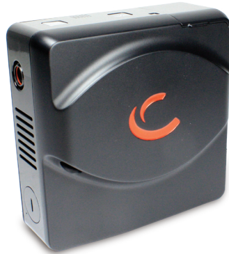
Prototype of new Driver.

We continue to make great progress on our research and development goals. Our single unit system remains on schedule to be completed in the third quarter of 2011. This device will also be offered to existing implanted patients that meet select criteria. While the patients will have to visit their physician to upgrade to the new system, no surgical or medical procedure is required to upgrade the patients.